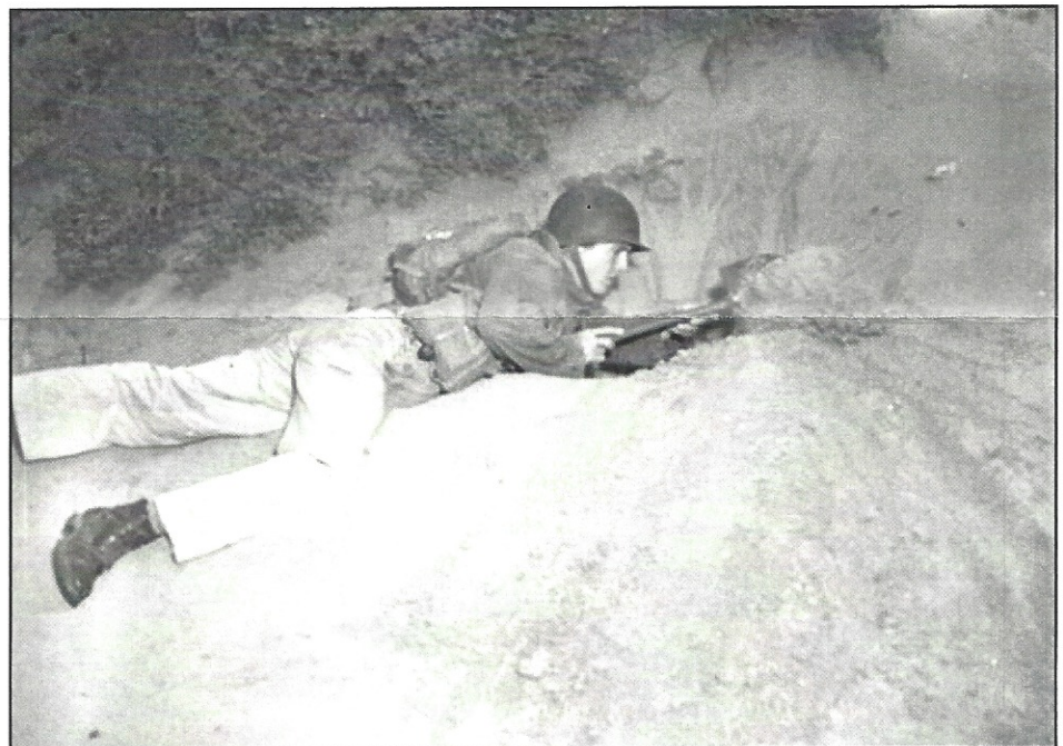
Training at Morro Bay

From 1945 to 1962, the military conducted 11 additional clearances for munitions and explosives of concern. Despite numerous clearance operations, munitions may be present on the former training area.